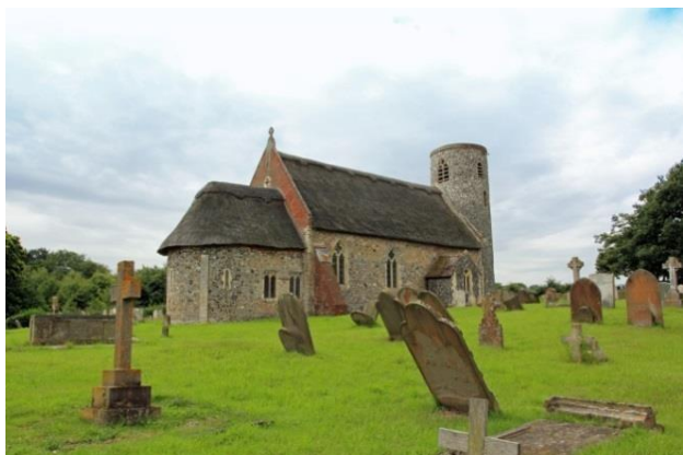
St Edmund Fritton