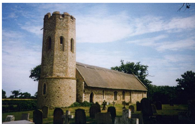
St Mary Ashby