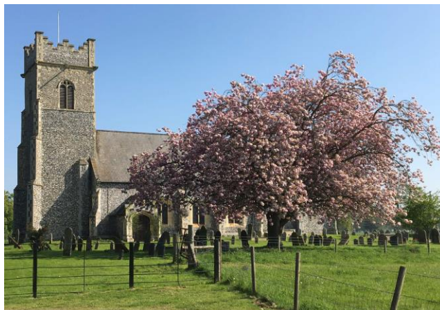
St Mary Somerleyton