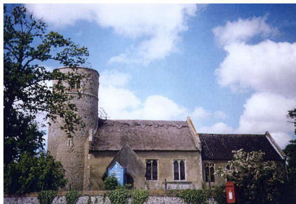
St Margaret Herringfleet