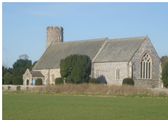
St Mary the Virgin Blundeston with Flixton