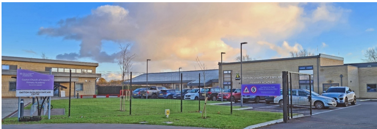
Gayton Church of England Primary Academy is part of the Diocese of Norfolk Education and Academies Trust. Opened in 2022 at a cost of £6m

Gayton School's ethos "The school works together in a Christian community to be ready to learn, respectful of everyone and safe to flourish. We challenge each other to be the best that we can be in mind, body and spirit to achieve more than we ever thought possible."