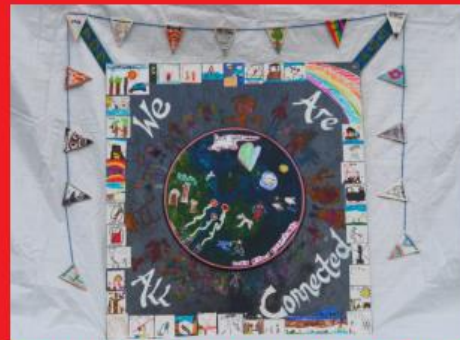
Artwork created by pupils at Marwood CE Infant School, Yorkshire, UK.