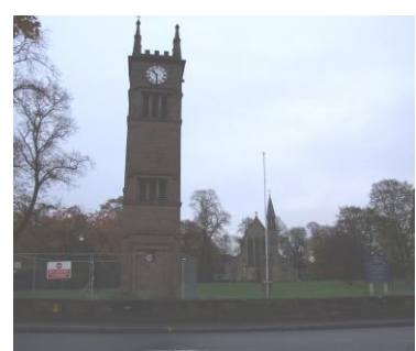
The old church tower at Ringley

Example 2: The early 18<sup>th</sup>century tower within the churchyard of the Victorian church at Ringley (Diocese of Manchester) is now looked after by the local authority.