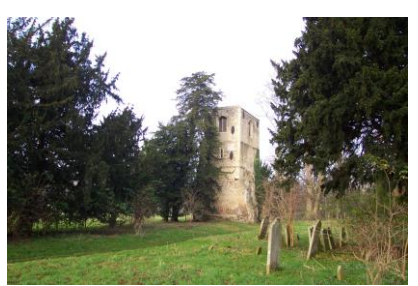
Thundridge Old Church

Example 2: The tower of the Medieval church at Thundridge (Diocese of St Albans) is within a moated enclosure which is a Scheduled Monument. This isolated ruin is near to walking paths and has been regularly affected by low-level vandalism.