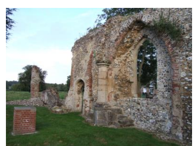
West Raynham, St Margaret with new altar

capitalising on the superb views of Buckfast Abbey.