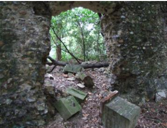
The effects of uncontrolled erosion

effects of weathering from all sides. Decay is often a long-term process but it can lead to partial or total collapse. Causes of decay include wind, rain and frost, which can wash out mortar and erode masonry.