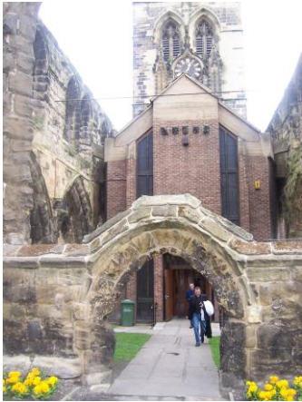
Pontefract All Saints – church within ruin

It was re-used with a new church built within the shell in 1831, expanded in the 1960s. Recently an ambitious project has been started to build a new worship space and community centre within the ruined walls.