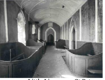
Little Livermere St Peter – the lost interior

Clearly an important "Strawberry Hill" late Georgian interior was lost. Stabilising the inaccessible and now overgrown ruin (see above) had since become a serious problem, which the DBF had to pay for.