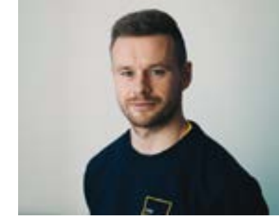
Tim Henery Sports Factory