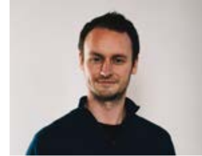
Jason Baldry Creative