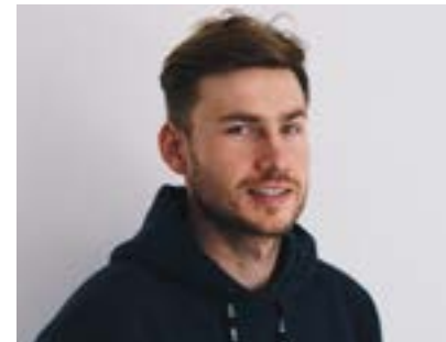
Rich Mills Kids, Youth, Students, Young Adults