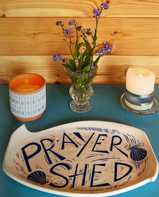
Photo: One of our clergy invites prayer requests on Facebook and offers them in her prayer shed.