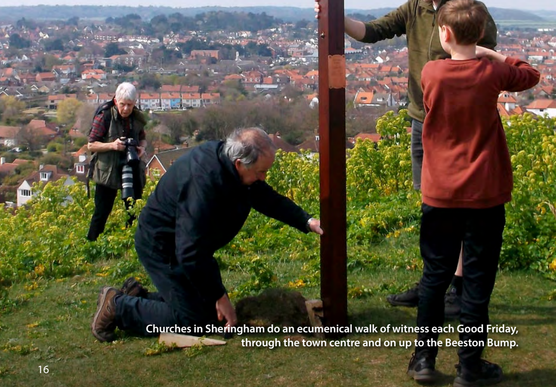
Churches in Sheringham do an ecumenical walk of witness each Good Friday, through the town centre and on up to the Beeston Bump.