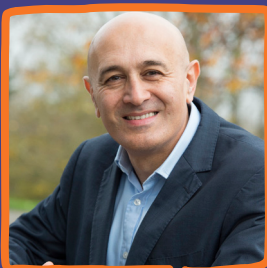
JIM AL-KHALILI , humanist and scientist

The universe is enormous and very old. Over 13 billion years ago everything in the universe was squeezed into a tiny space smaller than the full stop at the end of this sentence. Then, suddenly, the universe got bigger, very quickly – scientists call this the Big Bang . At first, tiny particles called atoms were formed.