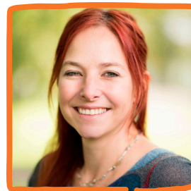
ALICE ROBERTS , humanist and scientist

All life, including human beings, evolved naturally. At first, life was simpler. Many small changes over a long, long period of time led to big changes and to all the plants and animals we can see around us today. Human beings are animals and we are related to all other living things on Earth.